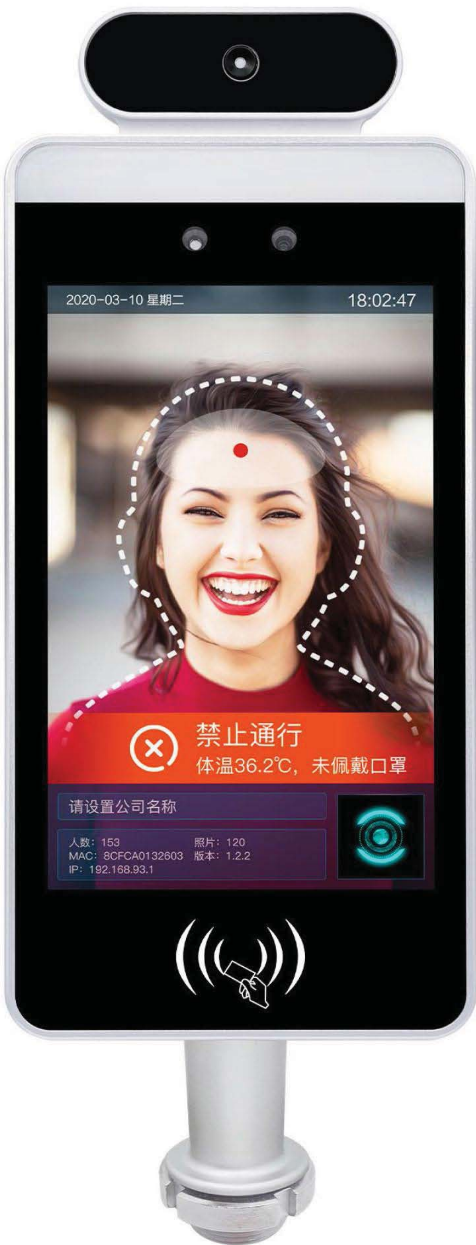
IC card / ID card